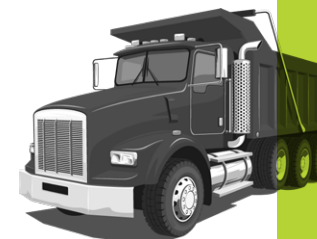
MULTIPLE LIFT AXLE