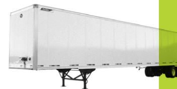
CLASS 7-8 TRAILER

PressureTech™ can be used as a standalone system with the mobile app or in combination with the AKTV8 iAir® gateway to connect to telematic systems. Unlike other systems, PressureTech™ is a configurable, made-easy platform that combines tire-pressure monitoring, onboard scales in a single telematics-ready system for the commercial truck and trailer applications.