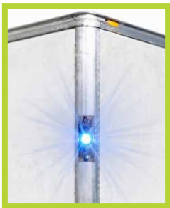
Corner-Mount, 270-Degree, Wide-Angle Warning Light